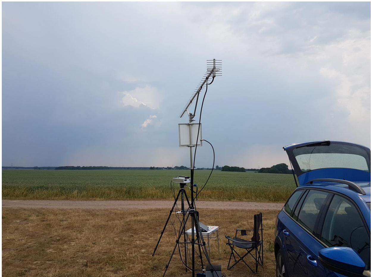
On friday afternoon first QSOs on 13/23cm from JO72AK (view dir west)